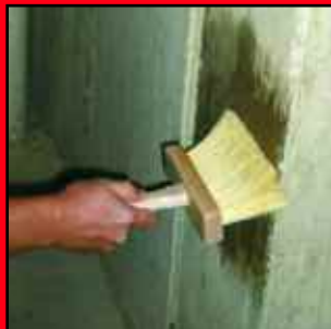
Applying waterproofing material with a masonry brush.