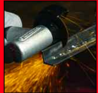
Cutting a piece of angle iron to size with a cut-off wheel.