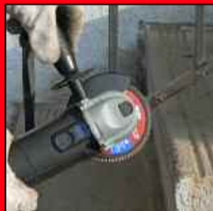
Removing rust from a railing before painting.