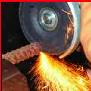
Cutting a piece of rebar to length.