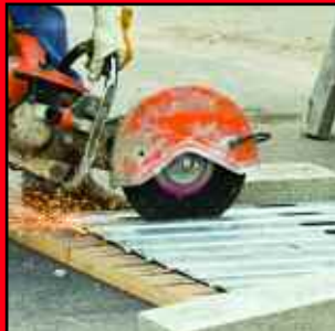
Sawing metal studs with a large cut-off wheel.