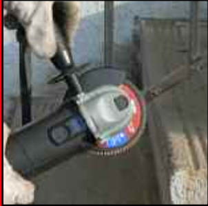
Removing rust from a railing before painting.