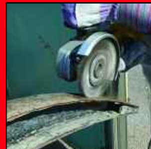
Prepping a machine guard for on-site welding and repair.