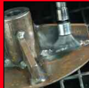
Cleaning hard-to-reach fillet welds on a gusseted base plate.