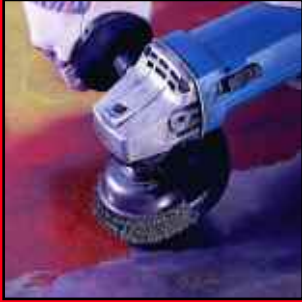
Removing paint from a steel surface with a crimped wire cup brush.