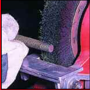
Cleaning threads with a crimped wheel brush.